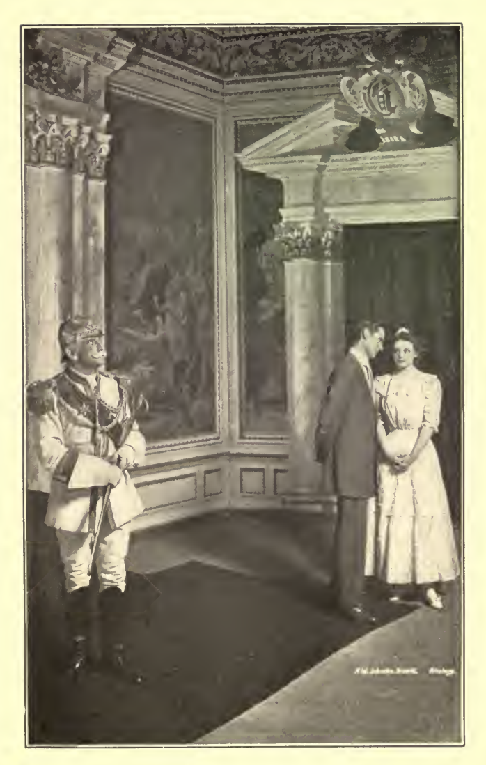
"Two's Company, Three's a Crowd."